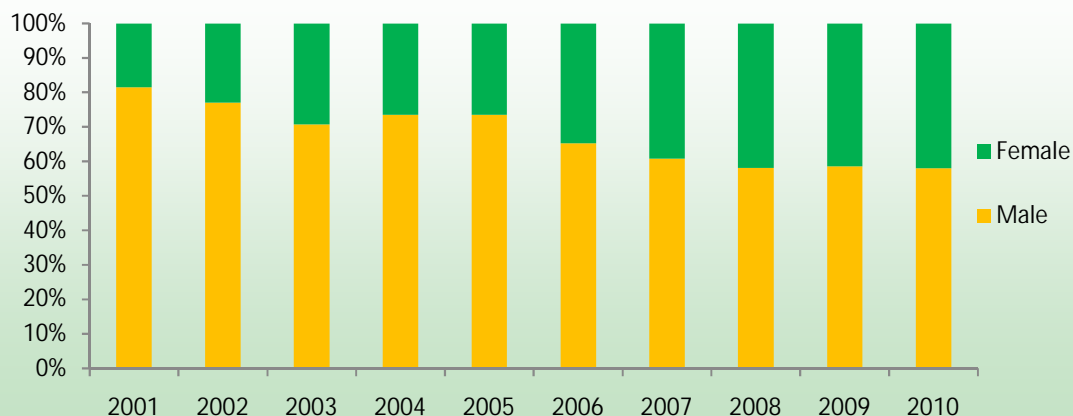
Figure 1: Reported HIV Infections by Sex: 2001 – July 2010